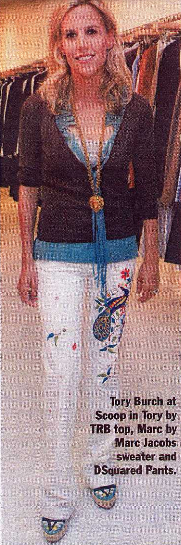
Tory Burch at Scoop in Tory by TRB top, Marc by Marc Jacobs sweater and DSquared Pants.